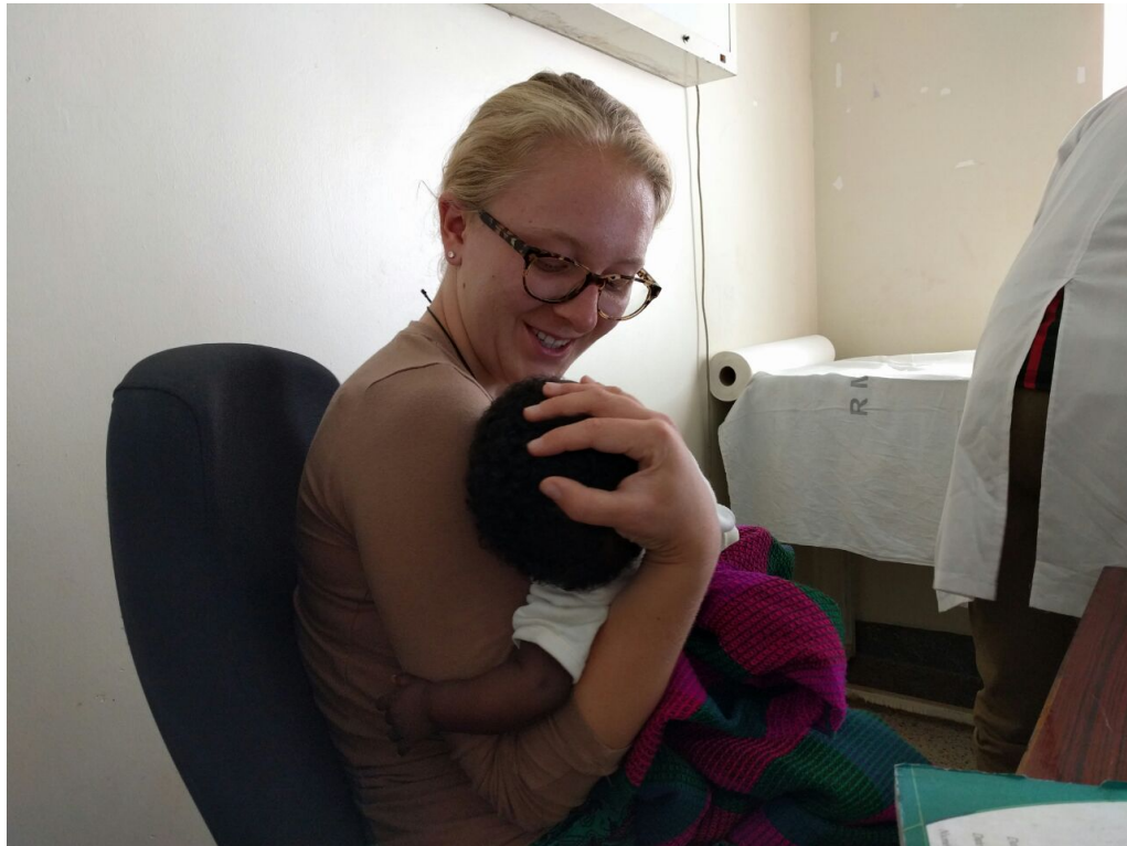
I hold a child while their mother is examined at the breast clinic

first aid kit. I'm not sure which of those doctors I will be, but it was extremely beneficial to learn that each of those skillsets are needed and wanted.