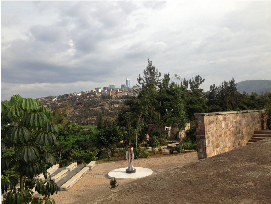
The view of downtown Kigali from the Genocide Memorial

uncomfortable living in the semi-police state of Rwanda. Despite this, I had extreme respect for Kagame's approach after witnessing the alternative in Bosnia and Herzegovina.