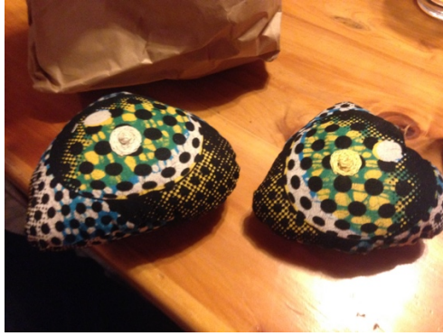
The first iteration of the prostheses