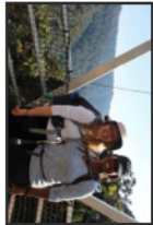
The USA researchers in Nyungwe Forest, near Bwira

Since the 1994 genocide, Rwanda has rebuilt its healthcare system to be among the most well-respected in the region, particularly for cancer care[3].