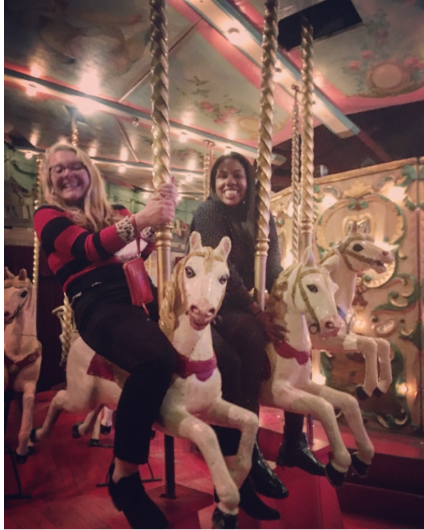
WCC reception at the Musée des Arts Forains