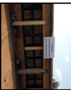
U Rwanda cancer campus in Bwira